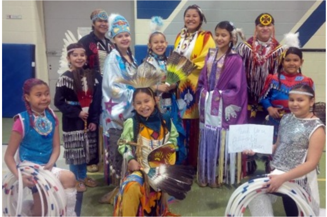
St. Mary's Dance Troupe