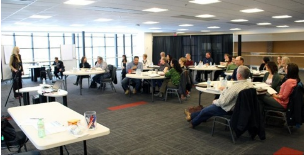
2016 orientation for new Affinity district council delegates