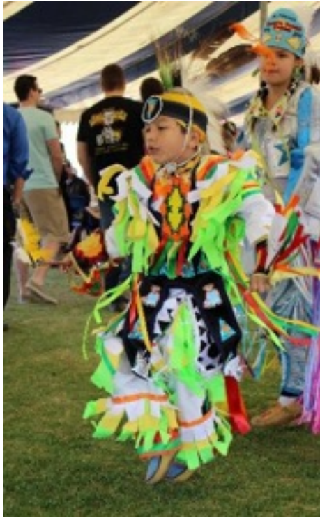
2015 Pleasant Hill Powwow